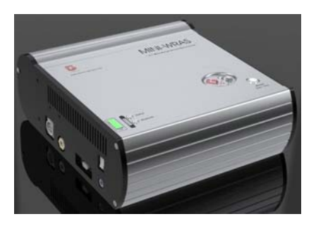
Figure 1. Grimm MINI-WRAS

It allows a wide range of particle size detection between 10 nm and 25 \mu m with 40 size channels with a time resolution of one complete scan of only 1 minute. Thus, very short-lived as well as highly time-varying particle sources can be examined. Figure 1 shows the MINI-WRAS device.